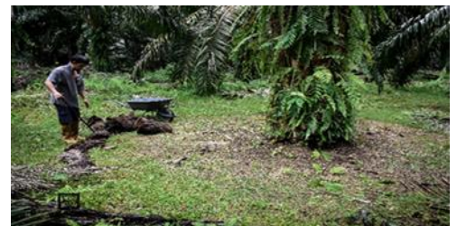
Figure 6: Sprinkling BIO fertilizer around oil palm trees