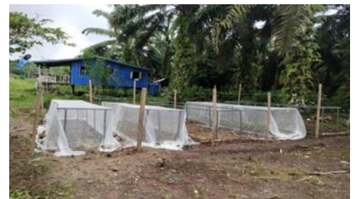
Figure 7: Cash crops in oil palm farms at WAGS BIO farm