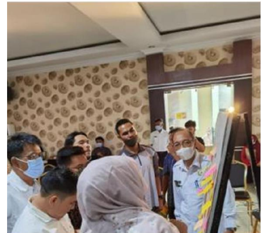
Figure 4: Multi-stakeholder workshop convened by the Subulussalam local district government and led by Earthworm Foundation.