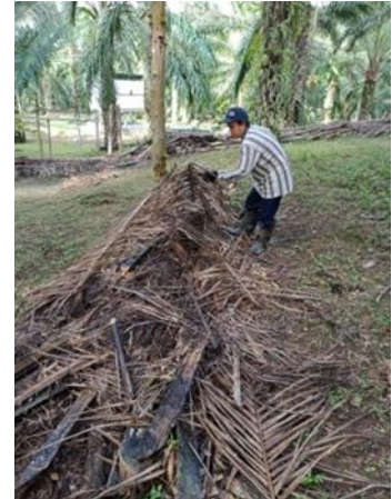
Figure 5: Training to make BIO fertilizer from compost leaves

WAGS BIO project is now in the pilot stage, focusing on establishing more BIO pilot farms; In the reporting period, the project newly designated 5 plots as a BIO Farm, which fulfill the BIO Farm criteria defined by Wild Asia. Some farms were enabled not only for reducing chemical fertilizer costs, but also earning by the cash crops integrated into their oil palm farms with steady yields.