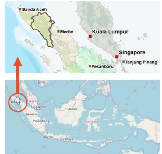
Figure 3: Aceh Landscape area, Indonesia